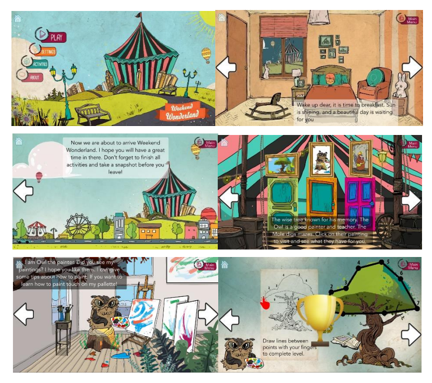
Figure 9 Screenshots of the "Weekend Wonderland" game