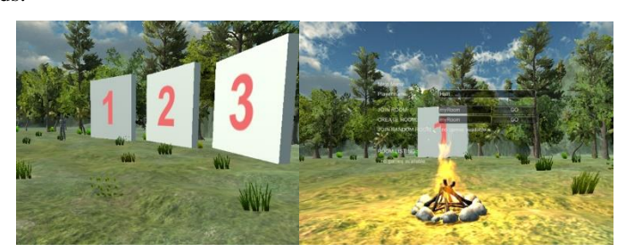
Figure 8 Screenshots of the Sequence game

• Weekend Wonderland game – The setting of this game is child friendly as it takes place in an amusement park. Tasks are presented in a playful way due to it. Weekend Wonderland is a story based game where the avatar of the player is the main character called Ash. As the name of the game suggests the game transpires on a weekend day. Ash is on a journey to the wonderland and player has to interact with the character and has to complete the levels by completing objectives. Aside from tablets and smartphones, this game is available on a computer as well.