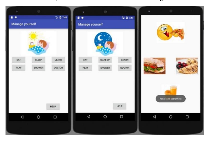
Figure 7 Screenshots of the "Manage Yourself" game during day, night and eating

• The "Manage Yourself" game – The user in the game has an avatar which means "himself as a playable character in the game". The user has to look after his avatar. He has to keep his avatar healthy and happy by feeding him and giving him drinks. It is also possible to play memory games with the avatar. Furthermore, the game teaches the user with lessons. It is beneficial to take a shower at night in the game before going to sleep by tapping on the dirty spots. If the avatar feels sick, it is useful to see a doctor in the game to cure him.