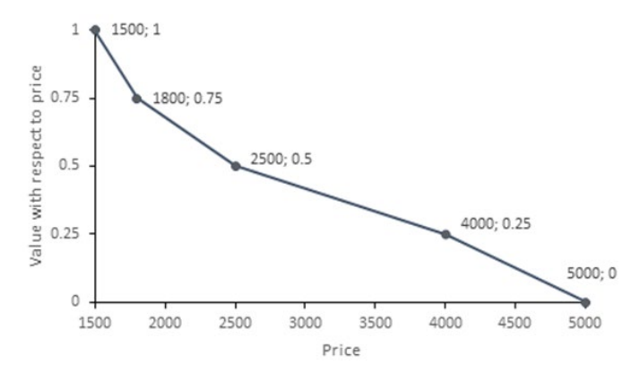
Figure 3 Piecewise linear value function for price

A: The increase of the quantity from 2500 \notin to 4000 \notin is equally unfavorable as its increase from 4000 \notin to 5000 \notin .