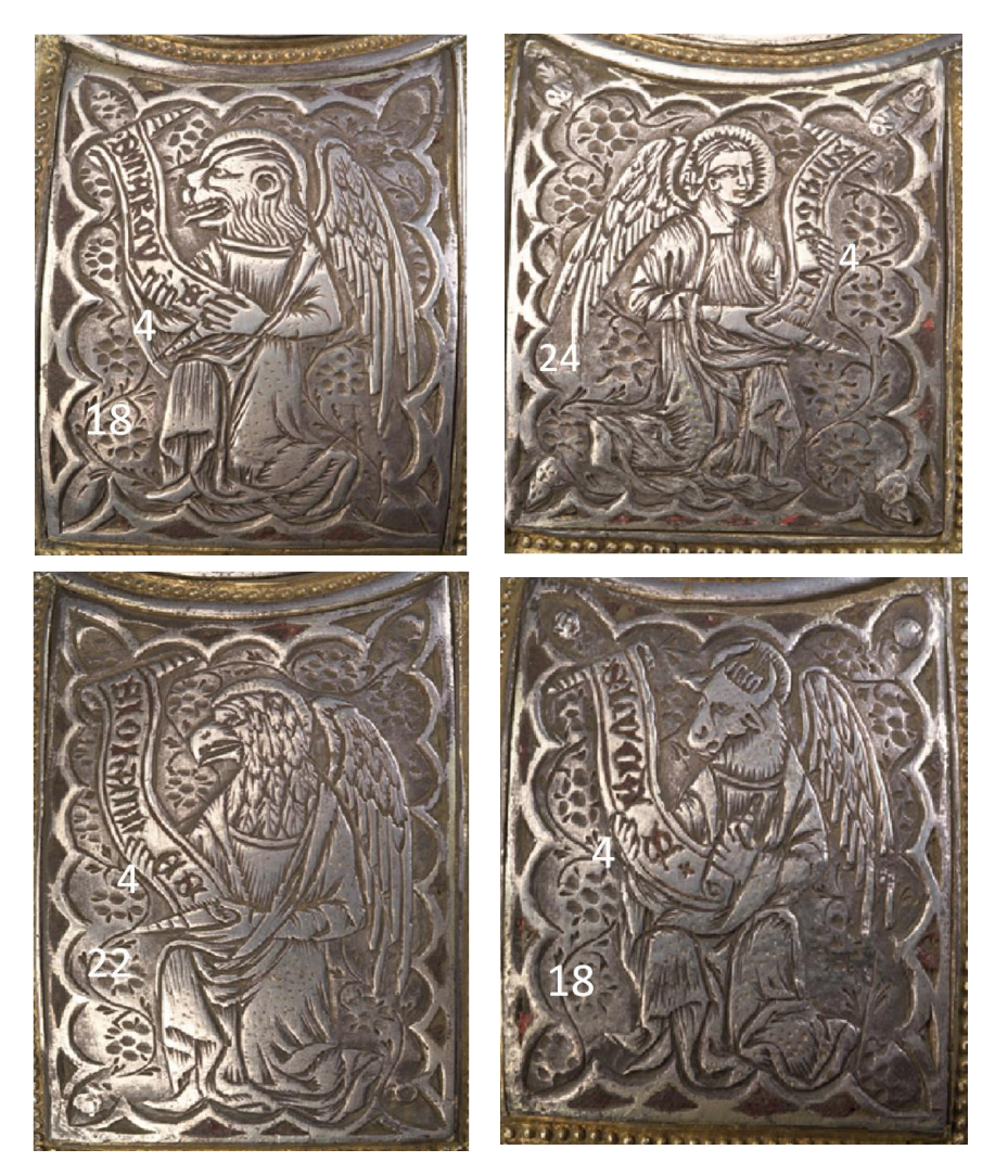
Figure\ A2 The four cherubs representing the four evangelists, together with the inscriptions. Above: S MARCV "S, S MATE " VS (!), below: S IOhAnn " ES, S LVCA " S x

The shape of the two crowns shows an old Hebrew Teth letter, which is the symbol of the womb in the Bahir (Section 84). The crown of Solomon according to Saint Great Gregory and the Hortus ' triple Solomonic crown description is also a symbolic womb of the king Messiah (see [33]).