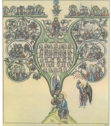
Figure 1 Inverse tree representations of the Creation and Incarnation (HolyCrown and Hortus)