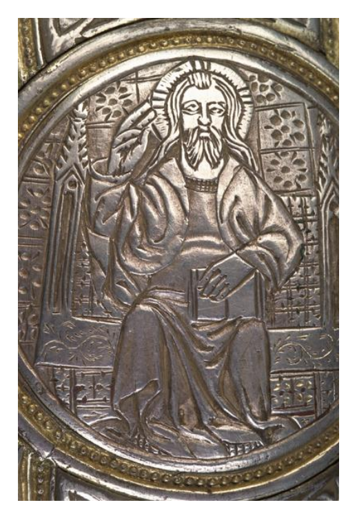
Figure A2 The Pantocrator picture of the Reliquary Crown

three "holies", ...God is King, God was King, God will be King forever and ever." (Bahir §. 126-7.) In the Bahir the heavenly troops consist of 3x24=72 entities (see §. 94-112) according to the image of 24 thrones, 24 crowned elders and 24 wings of the cherubs from Rev 4.8. Furthermore, the Holy Trinity with the seven spirits of God can be recognized here, by a medieval interpreter, as a symbolic image of the denary Sephirotic system. Consequently, in the Bahir, the cherubs and the Heavenly troops are crowning the Lord with the Trishagion which is the symbol here of the (comprised) treefold (!) crown of the Ten Sephiroth (§. 126-131). We can see that the Holy and the Reliquary Crown have the same representational and meaning system with the number 10 (and 19) as well as with the "number" and shape of the old Hebrew letter of Teth as a symbol of the holy kingly rebirth in the womb of the "Virgo, Mater Ecclesia" according to the Hortus' symbolical context. Therefore, the Bahir, at least partly, seems to be the "theoretical" basis for the "creation" of the representational and hidden meaning system for both crowns too.