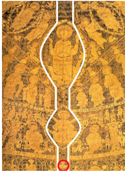
Figure 2 The Casula (Robe) of St. Stephen (1031). The "trunk" of the inverse tree with the "branches". St. Emeric can be seen in the red circle.