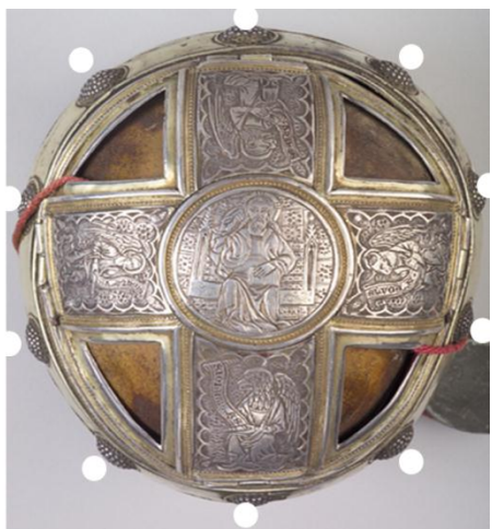
Figure A1 Top view of the St. Stephen's Holy Crown and the Reliquary Crown of St. Ladislaus.

Thus the twice four pictures may represents symbolically the two cherub-systems, as well probably ensuring the incarnation of the God through the ten Sephiroth between the two cherub-systems by the 10+8(4+4)+1 composition (see Jung's recognition of God's incarnation via the Sephiroth system in footnote 13 of Part II)<sup>27</sup>. This hypothesis may explain the "cosmic significance" of the King's coronation in the early 11^{th} century<sup>28</sup>. The Reliquary Crown of Saint Ladislaus (probably from the XII century), king of Hungary (1077-1095), shows a complete isomorphic structure with the Holy Crown concerning the four cherub faces with the four names of the four evangelists, which also means a "10+8+1" symbolic composition on the Reliquary Crown. It could mean an older tradition which also probably originated from the court of St Stephen of Hungary.