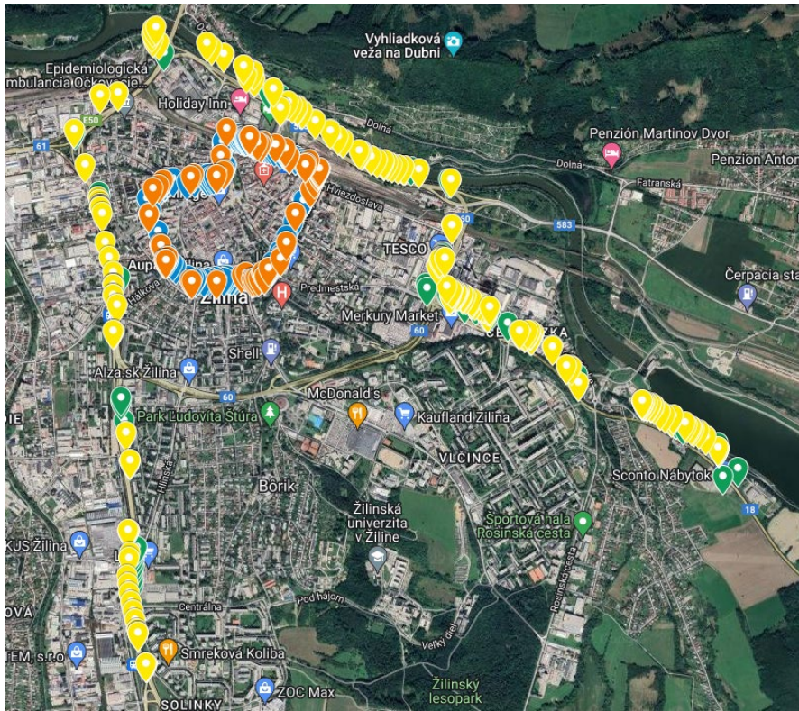
Routes and outdoor advertising placement in selected routes in Zilina

The third camera is a high-definition scene camera with a resolution of 1280 \times 960 p @24 fps, capturing the surrounding environment. The use of this equipment has been previously employed by the authors [35] in a study on experimental testing of vehicle-driver interaction through eye-tracking technology in laboratory conditions.